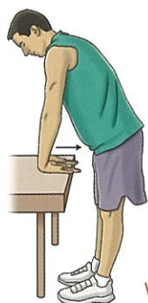
WRIST FLEXION STRETCH

4. WRIST FLEXION STRETCH: Stand with the back of your hands on a table, palms facing up, fingers pointing toward your body, and elbows straight. Lean away from the table. Hold this position for 15 to 30 seconds. Repeat 3 times. During this stretch you may do ice massage over the area of pain.