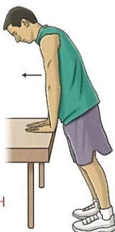
WRIST EXTENSION STRETCH

3. WRIST EXTENSION STRETCH: Stand at a table with your palms down, fingers flat, and elbows straight. Lean your body weight forward. Hold this position for 15 seconds. Repeat 3 times. During this stretch you may do ice massage over the area of pain.