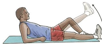
STRAIGHT LEG RAISE

4. STRAIGHT LEG RAISE: Lie on your back with your legs straight out in front of you. Bend the knee on your uninjured side and place the foot flat on the floor. Tighten the thigh muscle of the other leg and lift it