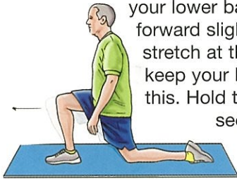
HIP FLEXOR STRETCH

1. HIP FLEXOR STRETCH: Kneel, then put your one leg forward, with the foot resting flat on the floor. From this position, tighten your stomach muscles, flatten your lower back and lean your hips forward slightly until you feel a stretch at the front of your hip. Try to keep your body upright as you do this. Hold this position for 15 to 30 seconds. Repeat 3 times on each side.